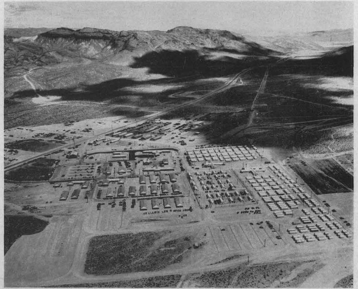
THIS AERIAL VIEW of Camp Mercury at the AEC's Nevada Test Site looks northward toward Yucca Pass

Decals will be sold at cost price of 25 cents.